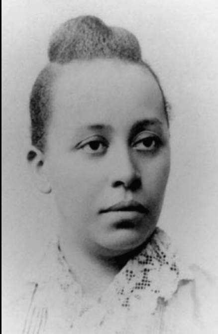
Dr. Halle Tanner Dillion Johnson

Namaste again, this month we are honoring Dr. Halle Tanner Dillion Johnson, the first woman of any race to practice medicine in the state of Alabama.